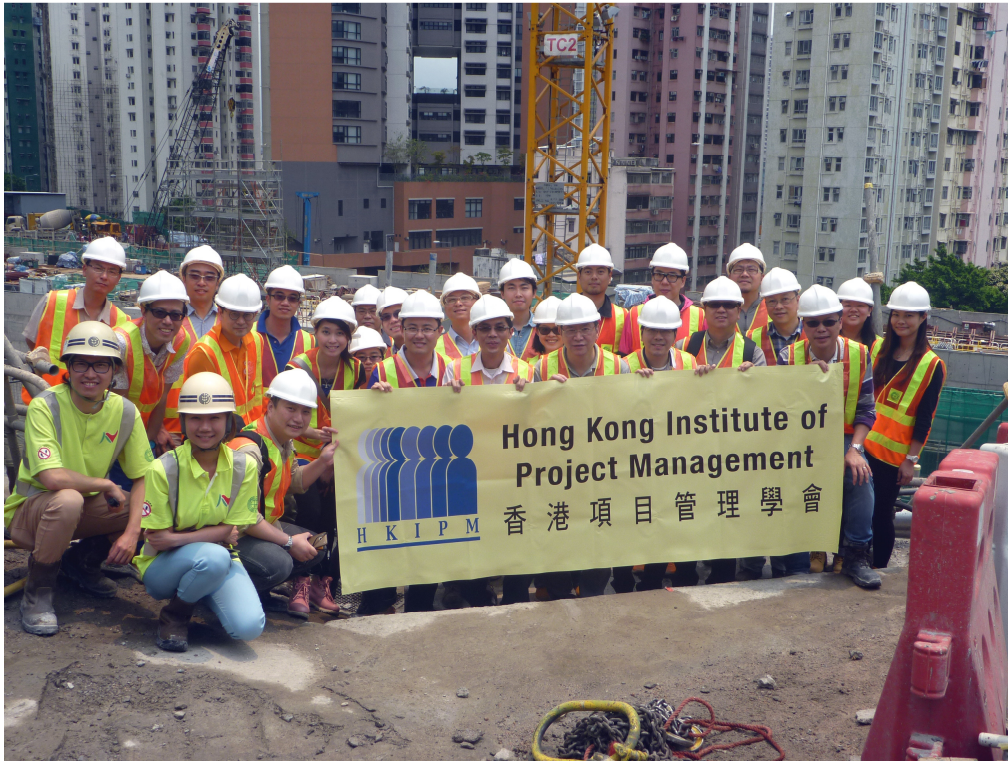
Group photo of the participants with the representatives from the main contractor after the guided site visit