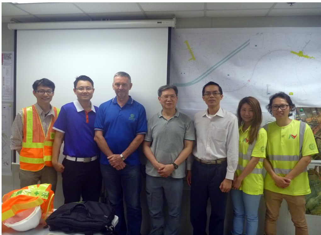
Group photo of some HKIPM council members with the representatives from the main contractor inside the site office