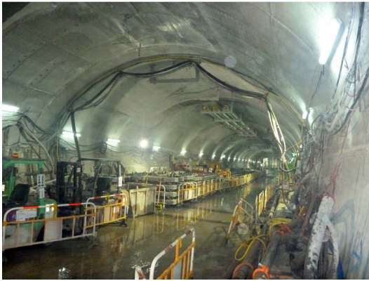
Cavern construction in progress