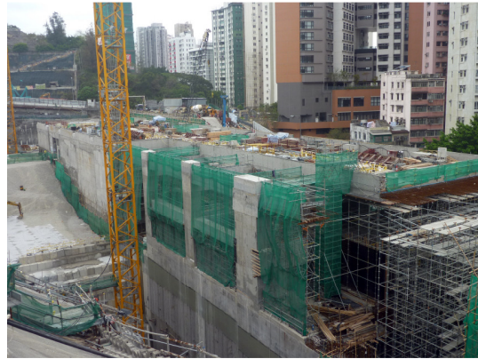
Ho Man Tin Station under construction