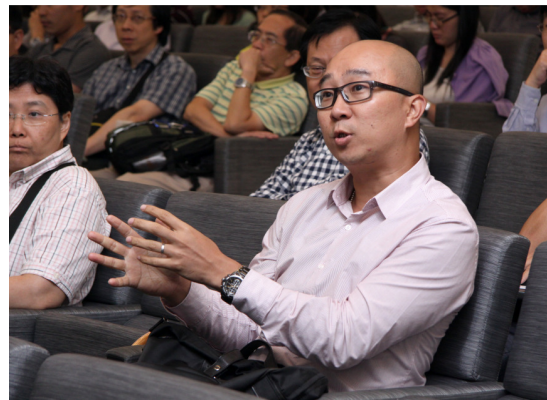
Questions from the audience during the Q&A session after the seminar