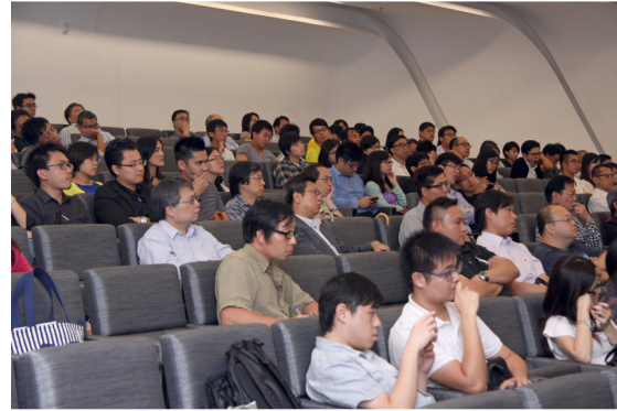
Full house participation by industrial practitioners