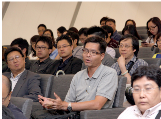
Questions from the audience during the Q&A session after the seminar