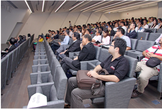
Full house participation by industrial practitioners