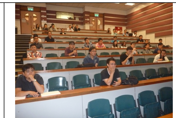
Full House Participation by the Taught Postgraduate Students of BRE, PolyU